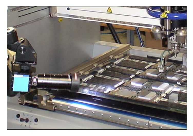
SIDE VIEW CAMERA